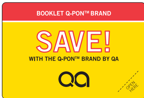
COVER, PAGE 1