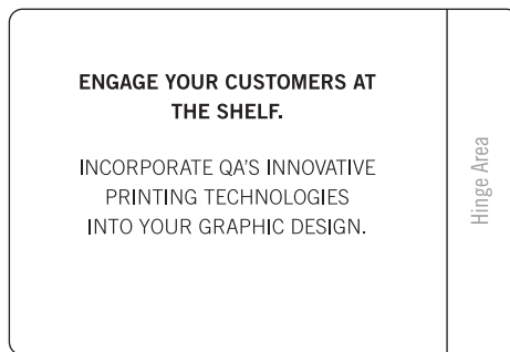
INSIDE COVER, PAGE 2