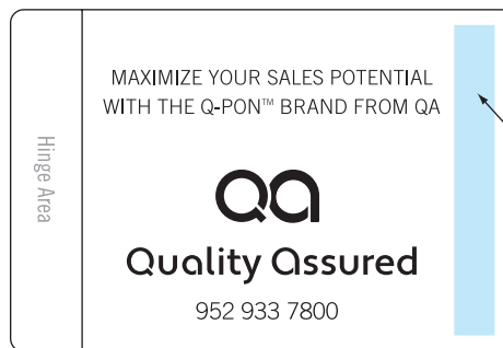
PRESSURE SENSITIVE BASE, PAGE 5